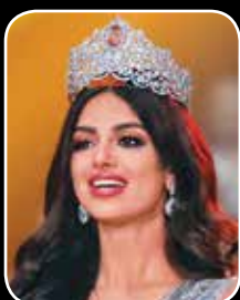
Harnaaz Kaur Sandhu